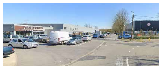
Van den Nest/ De Lijn