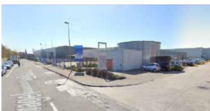
Inrit ex Callebaut/VDAB